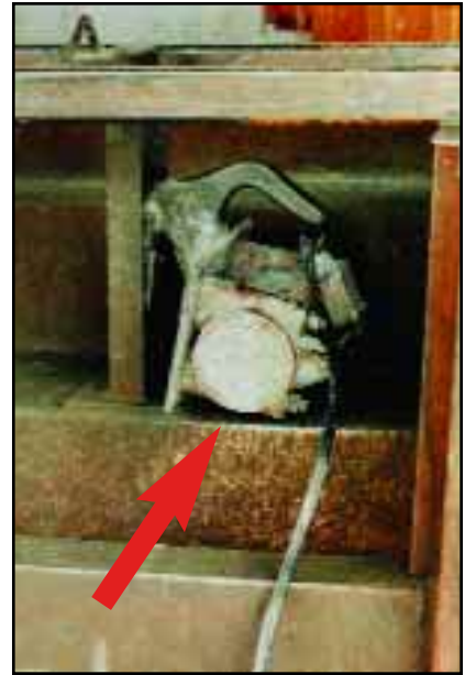
3-Step Form using US-900 Electric with UW-2 Wedge Bracket.

Concrete steps are generally poured either upside-down or straight up. Either way, our high frequency Model US-900 or US-1600 is the most frequently used electric vibrator. The SVRW-4000 or CCW-2000 (page 2-3) can be used if air vibrators are desired. They are placed on form stiffeners on the inside transmitting the vibration to the form side. Apply the same general rules for obtaining strong and smooth surfaces as for septic tanks.